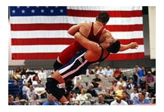
a Greco-Roman wrestling match

Greco-Roman wrestling is a style of wrestling practiced all over the planet. It was tested at the first modern Olympic Games in 1896 and has been associated with each advent of the Mid-Year Olympics beginning around 1908. This style of wrestling forbids under the midriff which is a significant difference between it and freestyle wrestling, the other type of wrestling in the Olympics. This handicap receives a complement on the throw. Since a wrestler may not use trips to take an opponent to the ground or throws by holding or receiving his opponent's leg.