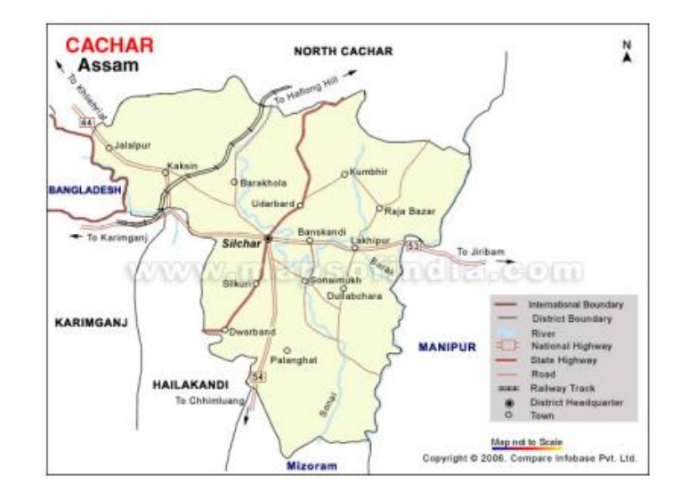
Figure 1.The situational analysis of child marriage and the use of the PCMA in the Cachar district of Assam is presented

from Marriage Act (PCMA) is enforced. Only then will they be able to effectively combat child marriage. Unhappily, many of these government and civil society projects are still in their infant stages, and a great deal of work still has to be done to prevent child marriage on a local level.