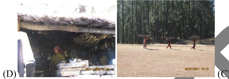
(A) View of a Church near Deolikhet (B) View of Himalayan Range from Ranikhet (C) Golf Course (D) A women is conducting restaurant