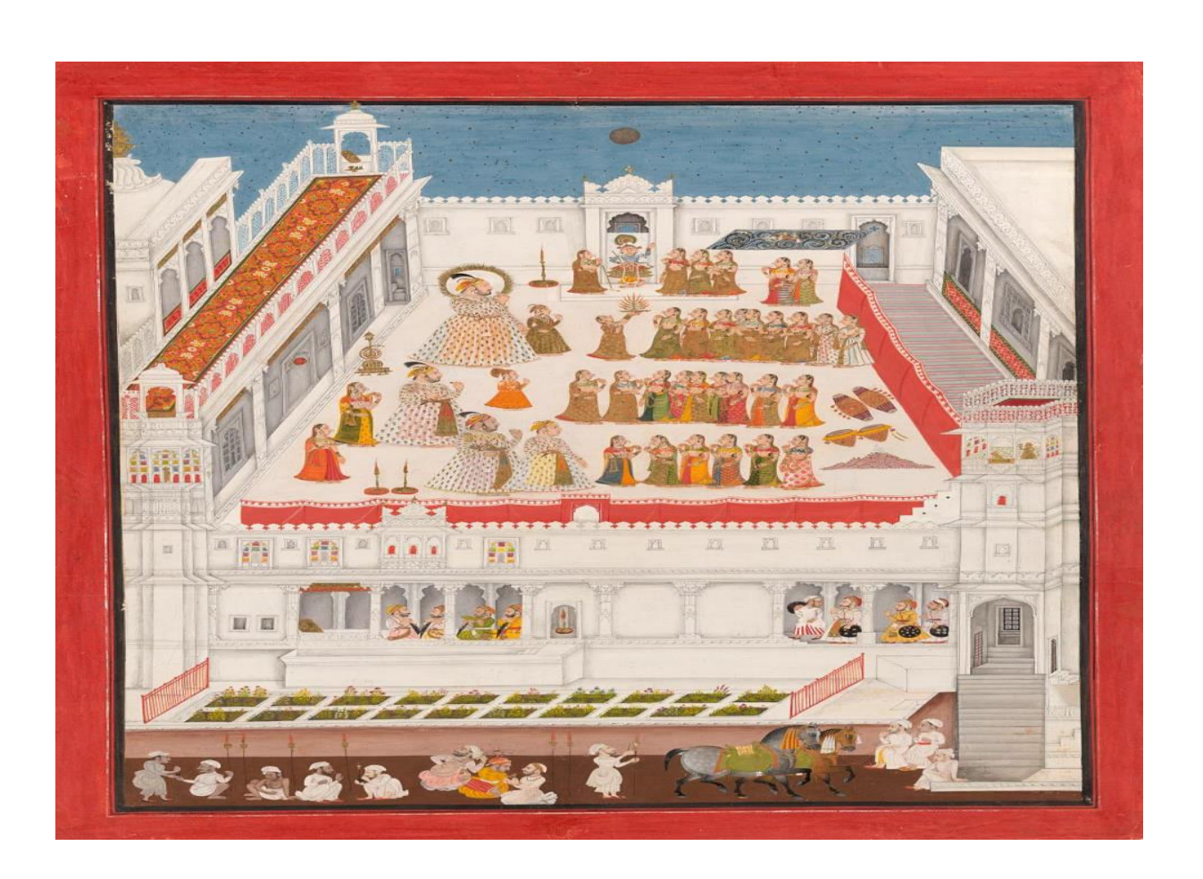
Image:6- Maharana Ari Singh in his palace, 17th century, Mewar, Maharana of Udaipur private collection

Indian art is distinguished by its audacious use of vibrant primary hues including reds, blues, green, yellow, and orange as well as black. The colour red symbolises both the manifestation of battle and the season of love. Indian art used colour more poetically and metaphorically than it did literally, reflecting the physicality of nature. According to the composition's mood, the colour was modified.